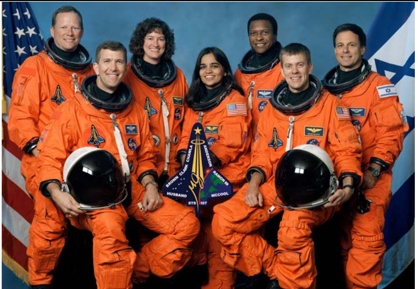
In memory of Space Shuttle Columbia's final crew, STS-107. Front row (L-R): Col. Rick Husband (USAF-Mission Commander), Dr. Kalpana Chawla, Comm. William McCool (USN-Pilot). Back row (L-R): Captain David Brown (USN), Commander Laurel Clark (USN), Lt. Col. Michael Anderson (USAF-Payload Commander), Col. Ilan Ramon (IAF – first Israeli in space).