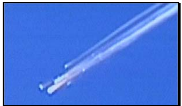
Columbia disintegrated upon reentry at an altitude of 200,000' and a speed of 12,500 MPH with the majority of debris landing in eastern Texas.