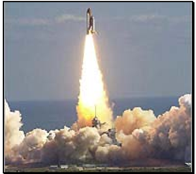
Columbia lifts off for the last time on January 16 th, 2003.

May God bless the grieving families, and may God continue to bless America.