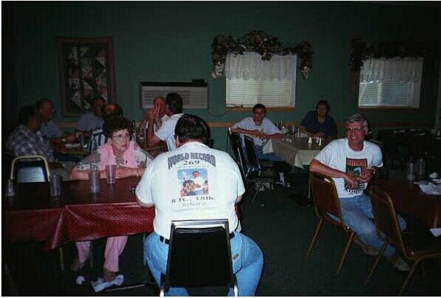
The banquet at last year's Nebraska Heat.

Event: NARAM 44. When: Sunday the 4 th through Friday the 9 th . Where: McGregor, TX. Description: NAR's week of model rocketry competition. Typically there is a lot of sport and some high power flying, too. For More Information: Go to www.naram2002.org .