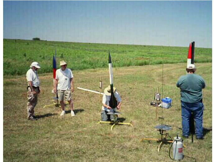
The pads are loaded up at last year's Nebraska Heat.

For More Information: Go to the calendar at www.tripol.org . More details of the launch will be hammered out in the next two months.